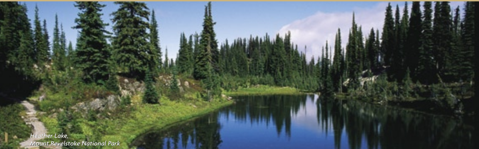
Heather Lake, Mount Revelstoke National Park