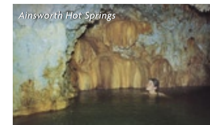
Ainsworth Hot Springs

find museums, artisan galleries, and plenty of outdoor activity options. In New Denver, visit the Nikkei Internment Memorial Centre, a museum dedicated to the preservation of the physical history and personal memories of Japanese Canadian internees. Nearby, the Galena Trail features a hiking and biking path on an abandoned rail line. Start the easy 13 km (8 mi) trail from Three Forks or on the lakeshore at Rosebery. And visit Sandon, the historic ghost town that once was the most populated city in the area.