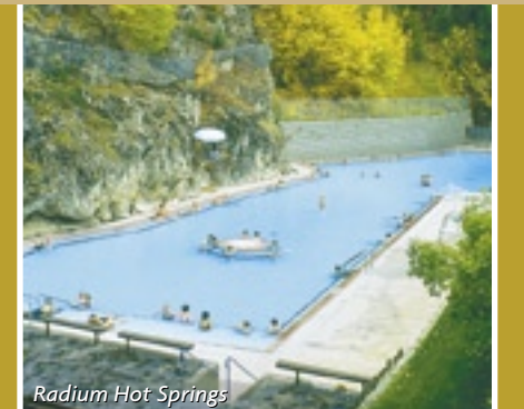
Radium Hot Springs

Please note: This route itinerary is only a suggestion. You can begin your journey from any point along the route.