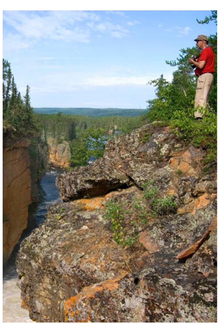
Skull Canyon, Clearwater River Provincial Park.