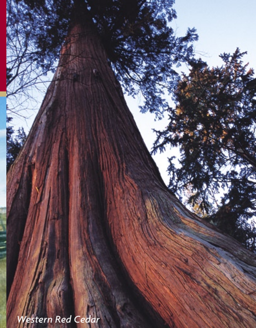
Western Red Cedar

“The Hill” to Heckman pass which rises 1,524 metres (5,000 ft) above the sea.