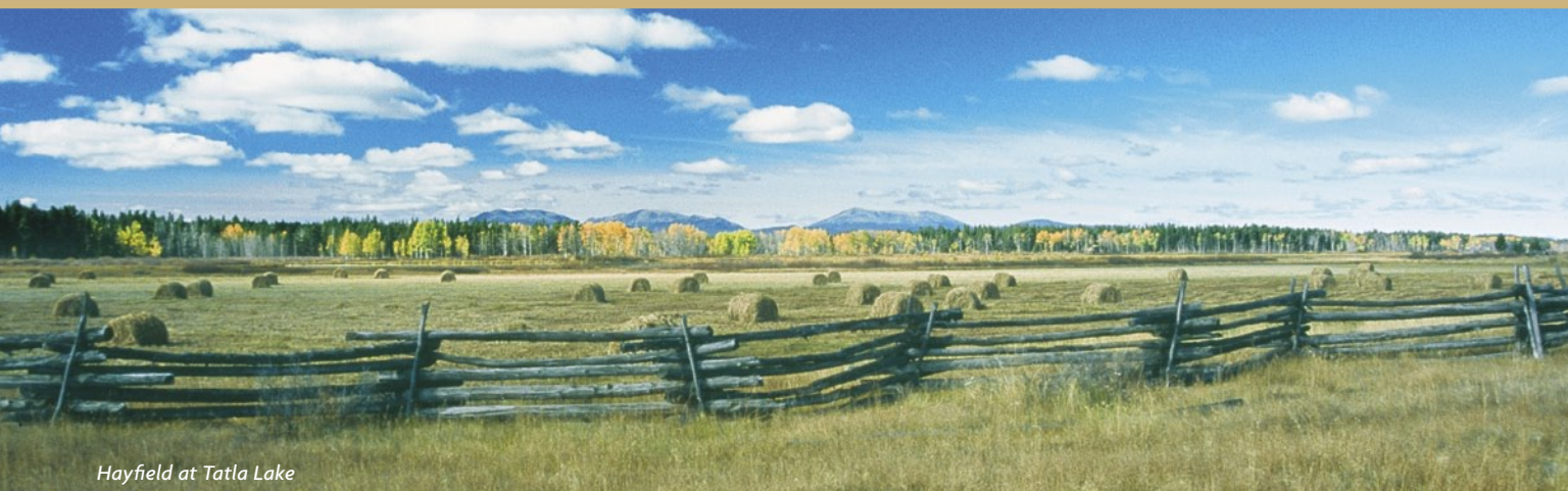
Hayfield at Tatla Lake