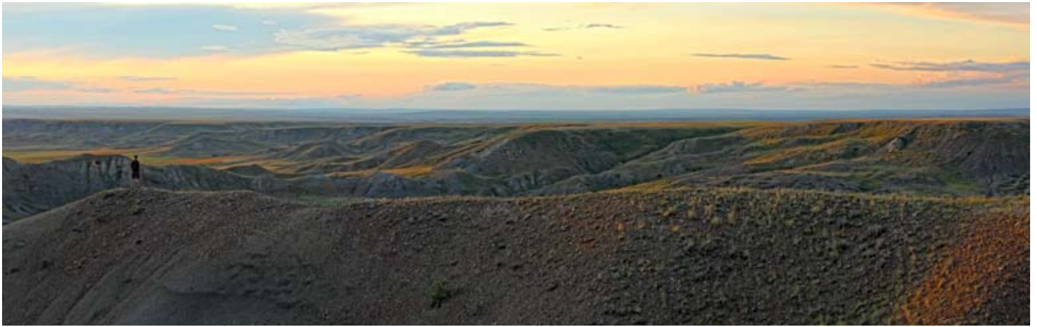
Grasslands National Park of Canada.