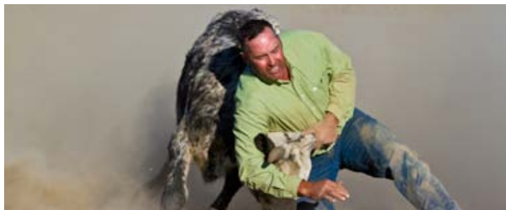
Wood Mountain Stampede.

This tour offers an authentic vacation experience that will bring you in contact with living legends, natural wonders and the adventurer within. Whether you're looking to live the life of a cowboy for a day, to explore the sweeping ranchlands by vehicle or to immerse yourself in history, this itinerary has something for everyone.