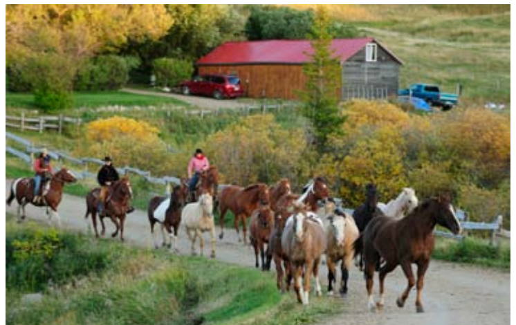
Historic Reesor Ranch.

Venture to the West Block Wilderness Area to discover Fort Walsh National Historic Site, a NWMP post established in 1875. Fort Walsh acted as the headquarters of the NWMP from 1878-1882 and played a key role in imposing law and order in the west. The Fort was later used as the Royal Canadian Mounted Police (RCMP) Remount Ranch, which bred horses for the famed RCMP Musical Ride from 1942-1968. Guided tours of the fort are provided by staff in period costume and self-guided tours of the nearby townsite and cemeteries may be taken.